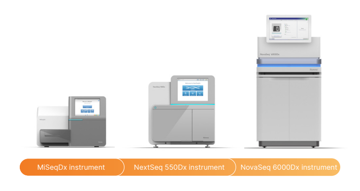
Figure 2: Optimized performance across validated platforms— These FDA-regulated, CE-marked IVD instruments offer userfriendly interfaces, enhanced security, and high-quality results for clinical applications.

Illumina DNA Prep with Enrichment Dx is compatible with the MiSeg<sup>™</sup>Dx NextSeg<sup>™</sup> 550Dx and NovaSeg<sup>™</sup> 6000Dx instruments (Figure 2). These FDA-regulated and Conformité Européene in vitro diagnostic (CE-marked IVD) platforms are designed specifically to bring the power of NGS to the clinical laboratory. Taking advantage of proven Illumina sequencing by synthesis (SBS) chemistry, these instruments provide highly accurate and reliable results for diagnostic testing.