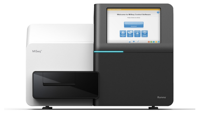
Figure 1: MiSeq System—The compact MiSeq System is well suited for rapid, cost-effective next-generation sequencing.

The MiSeq System offers the first DNA-to-data sequencing platform integrating cluster generation, amplification, sequencing, and data analysis into a single instrument. Its small footprint—approximately two square feet—fits easily into virtually any laboratory environment (Figure 1). The MiSeq System leverages Illumina sequencing by synthesis (SBS) chemistry, a proven next-generation sequencing (NGS) technology responsible for generating more than 90% of the world's sequencing data. With the power of NGS delivered in a compact footprint, the MiSeq System is the ideal platform for rapid and cost-effective genetic analysis.