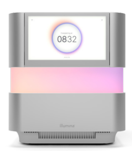
Figure 2: NextSeq 1000 and NextSeq 2000 Sequencing Systems— The NextSeq 1000 and NextSeq 2000 systems harness the latest advances in SBS chemistry to streamline sequencing workflows.

The NextSeq 1000 and NextSeq 2000 exome sequencing solution simplifies exome sequencing, enabling researchers to maximize their productivity. It begins with library preparation and exome enrichment using