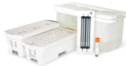
Figure 1: NovaSeq 6000 v1.5 Reagent Kit —The NovaSeq 6000 v1.5 Reagent Kit provides improved economics, more flexible sequencing workflows, and extended reagent shelf-life.

In addition to enhanced support for UDIs and UMIs, the NovaSeq 6000 v1.5 Reagent Kit includes sequencing primers needed to run Illumina DNA PCR-Free Prep, Tagmentation. This innovative library prep kit uses On-Bead Tagmentation to generate sequencing-ready libraries in < 1.5 hours. Combining Illumina DNA PCR-Free Prep, Tagmentation with v1.5 reagents avoids introducing PCR bias into WGS studies, which can lead to uneven coverage across regions of the genome.